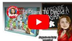
El Plan, tú decides – Jugando con Ketty