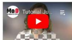
Lista de reproducción El Plan, la aventura de emprender